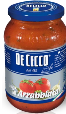
ARRABBIATA SAUCE DEC914 400 g x 6 8001250219145