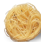
CAPELLI D'ANGELO #209 DEC209 500 g x 10 8001250152091 KOSHER