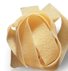
PAPPARDELLE NIDI #201 DEC201 500 g x 10 8001250152015 KOSHER