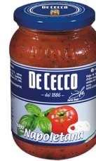
NAPOLETANA SAUCE DEC916 400 g x 6 8001250219169