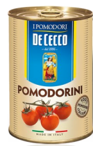
CHERRY TOMATO DEC994 400 g x 12 8001250009821