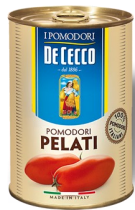
WHOLE PEELED TOMATO DEC991 400 g x 12 8001250019769