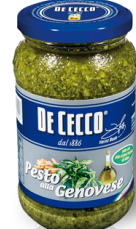
PESTO ALLA GENOVESE DEC919 200 g x 12 8001250099198