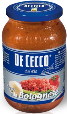
BOLOGNESE SAUCE DEC911 400 g x 6 8001250219114