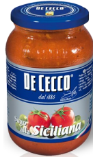
SICILIANA SAUCE DEC913 400 g x 6 8001250219138