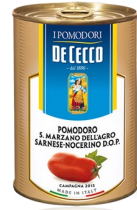
SAN MARZANO TOMATO DEC995 400 g x 12 SUBJECT TO AVAILABILITY