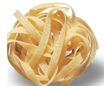
TAGLIATELLE NIDI #203 DEC203 500 g x 10 8001250152039 KOSHER