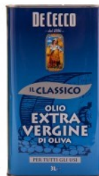
EXTRA VIRGIN OLIVE OIL DEC704 3 lt x 4 8001250220042 KOSHER