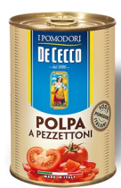
CHOPPED TOMATO DEC996 400 g x 12 8001250009739 - INDIVIDUAL 8001250019738 - 3 PACK