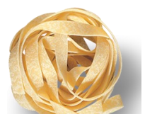
FETTUCCINE NIDI #233 DEC233 500 g x 10 8001250152336 KOSHER