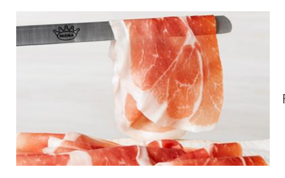
Prosciutto Crudo Slicing Log