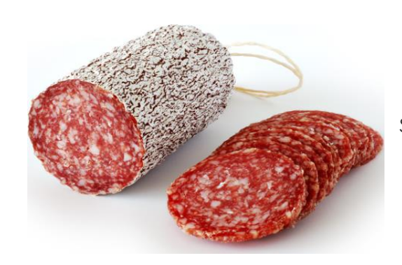
Salami Milano Slicing Log